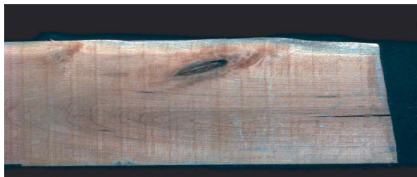
Detailed view for grader assistance.